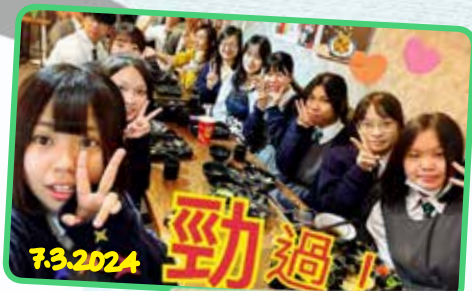
中六最後上課日聚餐..... 預祝 DSE 獲取佳績