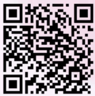
畢業生榮譽榜 2019-2023 年