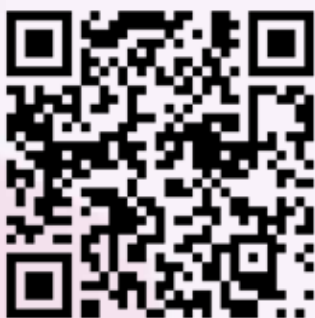
學校簡介 2023-2024 年度