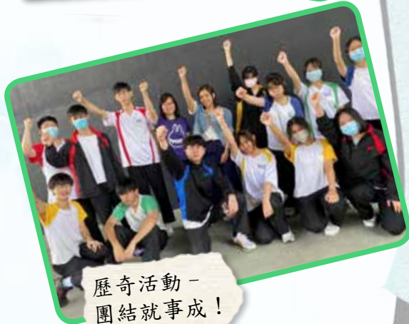
歷奇活動 - 團結就事成!