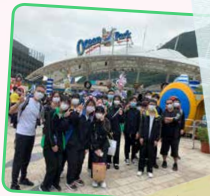
一起走過 Ocean Park