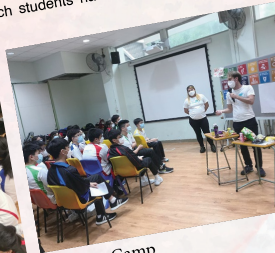
Summer Camp for F.1-3