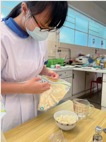
Ice Cream Making