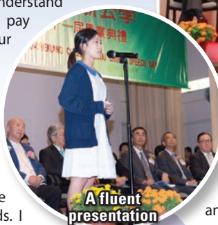
A fluent presentation

Sometimes, we may feel frustrated with our studies and we are under great stress. Remember, don't forget what makes us persevere and don't lose your passion. We all know it is never easy to make your dreams come true. If you do not give up, you are one step closer to success.