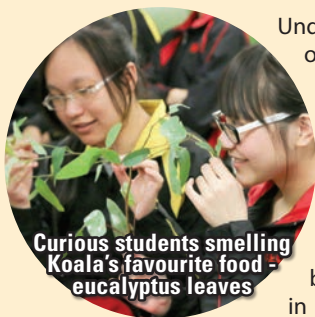
Curious students smelling Koala's favourite food - eucalyptus leaves