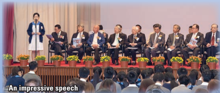
An impressive speech

Some of us have continued our studies in university. Some of us have started work. Our ultimate goal may be the same. We all want to succeed in the future and contribute to society. The clock ticks every second with no intention to wait for us, we therefore need to grab our chances and do our best in everything for a bright future. I, however, have a very humble wish. I hope that ten years down the road, I can sing that song again, happy or sad, to appreciate what I have been through and value every moment that our life brings us. Thank you.