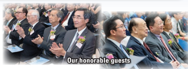
Our honorable guests

Our main building, with the design of a 'U' shape, is like two arms stretching out to hug every one of us. With its arms wide open, our school gave us a warm welcome every morning. Day in and day out it helped develop our sense of belonging. When