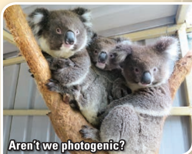
Aren't we photogenic?

Ocean Park is busy showing their hospitality to our friends from Australia, the 3 koalas that will be residing in the new attraction called 'Adventures in Australia' that is to open in March. There had been a few rounds of events taking place before these koalas were sent to Hong Kong. In the first round, a number of our F4 students took part in a cultural exchange program with a group of Year 11 (Form 5) students from Australia.